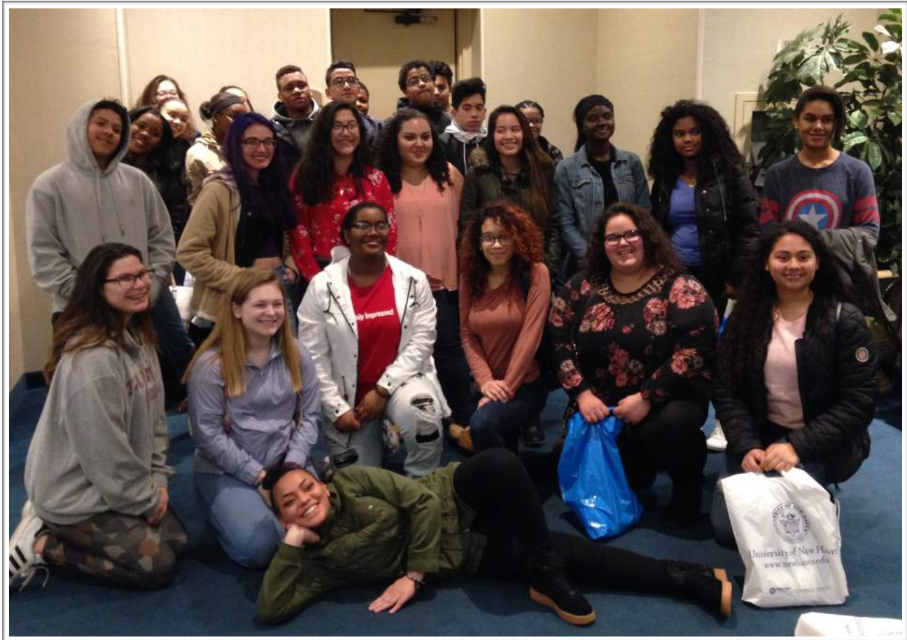
Students posing for a photo at TRIO Day, held in Cromwell, CT this year

Every year in February, UBMS takes a group of students to TRIO Day for an amazing experience. TRIO Day is a day of celebration, reflection and action around increased access to higher education for underrepresented, disadvantaged students. TRIO programs like Upward Bound Math Science gather together, and in New England it takes place in a different state every year. The trip includes college tours, a dance, community service, powerful speakers, and workshops, as well as other fun activities.