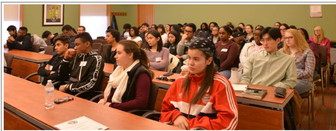
Students listening to a panel discussion at the PIE Conference in March.

Wesleyan's Office of Equity and Inclusion coordinates five programs: the Mellon Mays Undergraduate Fellowship, the Ronald E. McNair Post-baccalaureate Achievement Program, the Wesleyan Math and Science Scholars Program (WesMaSS), the Posse Veteran Scholars Program and the Upward Bound Math-Science Program. Together, all of these programs make up the Pathways of Inclusive Equity (PIE) whose purpose is to increase a sense of community amongst students, faculty and staff. Their goal is to remove obstacles along the pathways to secondary and post-secondary education for students who come from historically underrepresented backgrounds and to provide opportunities and access to these programs.