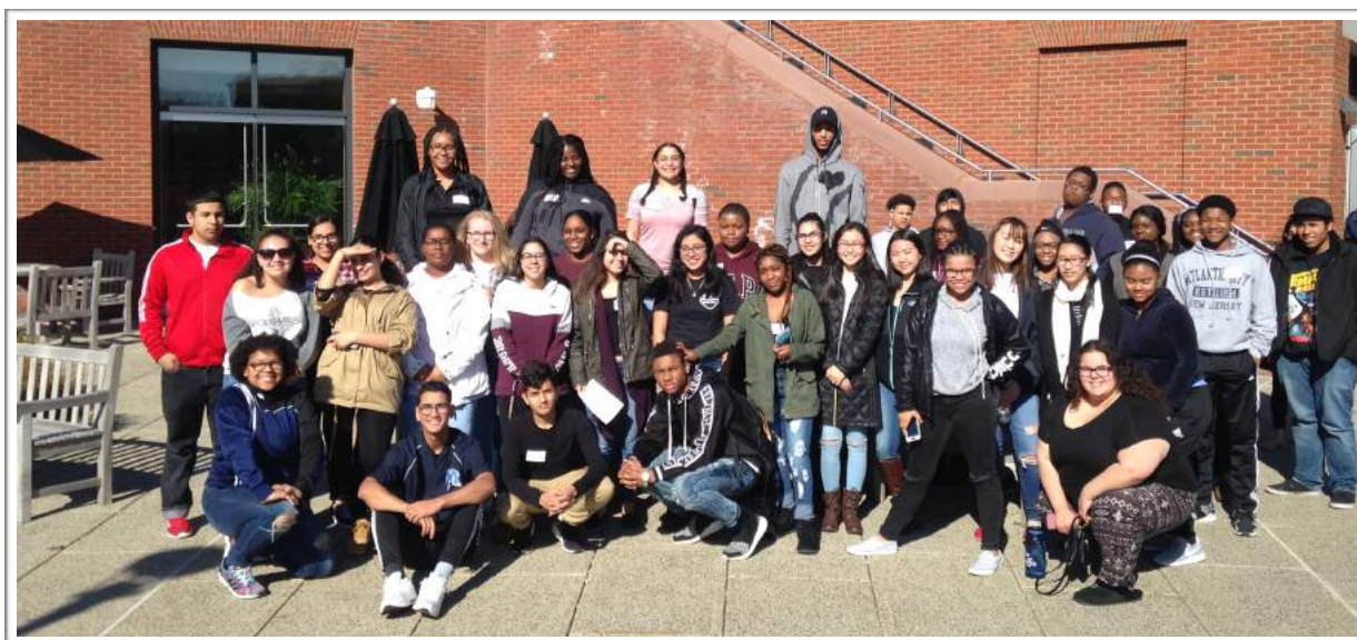
Students outside the PIE Conference in March (See page 3 for more on the PIE Conference)